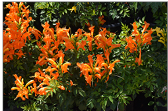
Cape Town Orange Cape Honeysuckle flowers