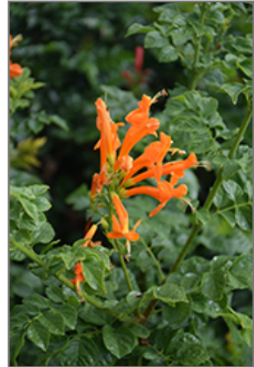
Cape Town Orange Cape Honeysuckle flowers

Cape Town Orange Cape Honeysuckle is recommended for the following landscape applications;