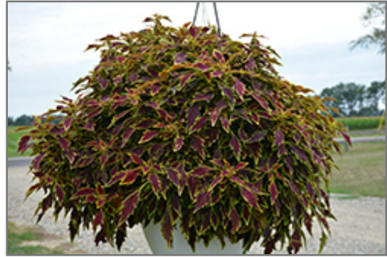
FlameThrower Serrano Coleus

FlameThrower Serrano Coleus will grow to be about 18 inches tall at maturity, with a spread of 16 inches. When grown in masses or used as a bedding plant, individual plants should be spaced approximately 15 inches apart. It grows at a fast rate, and under ideal conditions can be expected to live for approximately 5 years. As an evergreen perennial, this plant will typically keep its form and foliage year-round.