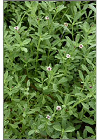
Texas Frogfruit flowers

A semi-evergreen perennial groundcover with creeping stems that root from the nodes; produces upright flower stems with clusters of white blooms from spring to fall; foliage is dense, green, and toothed; a rapid grower that can form dense stands