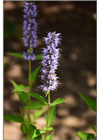
Blue Fortune Anise Hyssop flowers

Blue Fortune Anise Hyssop is a fine choice for the garden, but it is also a good selection for planting in outdoor pots and containers. With its upright habit of growth, it is best suited for use as a 'thriller' in the 'spiller-thriller-filler' container combination; plant it near the center of the pot, surrounded by smaller plants and those that spill over the edges. It is even sizeable enough that it can be grown alone in a suitable container. Note that when growing plants in outdoor containers and baskets, they may require more frequent waterings than they would in the yard or garden.