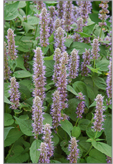
Blue Fortune Anise Hyssop flowers

Blue Fortune Anise Hyssop is a dense herbaceous perennial with an upright spreading habit of growth. Its medium texture blends into the garden, but can always be balanced by a couple of finer or coarser plants for an effective composition.