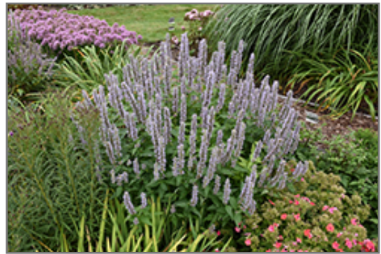
Blue Fortune Anise Hyssop in bloom