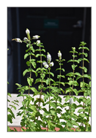
Spearmint flowers