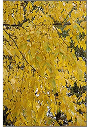
American Elm in fall

This tree should only be grown in full sunlight. It is an amazingly adaptable plant, tolerating both dry conditions and even some standing water. It may require supplemental watering during periods of drought or extended heat. It is not particular as to soil type or pH, and is able to handle environmental salt. It is highly tolerant of urban pollution and will even thrive in inner city environments. This species is native to parts of North America.