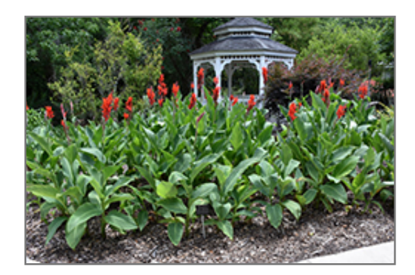
Canna in bloom

This plant should only be grown in full sunlight. It requires an evenly moist well-drained soil for optimal growth, but will die in standing water. It may require supplemental watering during periods of drought or extended heat. To help this plant achive its best flowering performance, periodically apply a flower-boosting fertilizer from early spring through into the active growing season. It is not particular as to soil pH, but grows best in rich soils. It is highly tolerant of urban pollution and will even thrive in inner city environments, and will benefit from being planted in a relatively sheltered location. Consider applying a thick mulch around the root zone in winter to protect it in exposed locations or colder microclimates. This particular variety is an interspecific hybrid. It can be propagated by division; however, as a cultivated variety, be aware that it may be subject to certain restrictions or prohibitions on propagation.