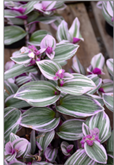
Nanouk Tradescantia foliage

This is an herbaceous evergreen houseplant with a spreading, ground-hugging habit of growth. Its relatively fine texture sets it apart from other indoor plants with less refined foliage. This plant may benefit from an occasional pruning to look its best.