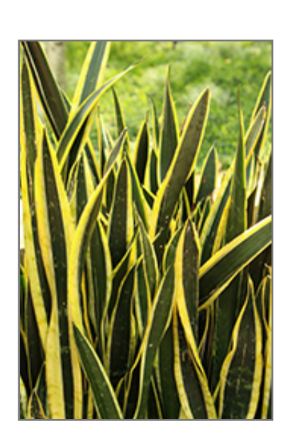
Black Gold Snake Plant foliage

When grown indoors, Black Gold Snake Plant can be expected to grow to be about 3 feet tall at maturity, with a spread of 12 inches. It grows at a slow rate, and under ideal conditions can be expected to live for approximately 10 years. This houseplant performs well in both bright or indirect sunlight and strong artificial light, and can therefore be situated in almost any well-lit room or location. It is very adaptable to both dry and moist soil, but will not tolerate any standing water. The surface of the soil shouldn't be allowed to dry out completely, and so you should expect to water this plant once and possibly even twice each week. Be aware that your particular watering schedule may vary depending on its location in the room, the pot size, plant size and other conditions; if in doubt, ask one of our experts in the store for advice. It will benefit from a regular feeding with a general-purpose fertilizer with every second or third watering. It is not particular as to soil pH, but grows best in sandy soil. Contact the store for specific recommendations on pre-mixed potting soil for this plant.