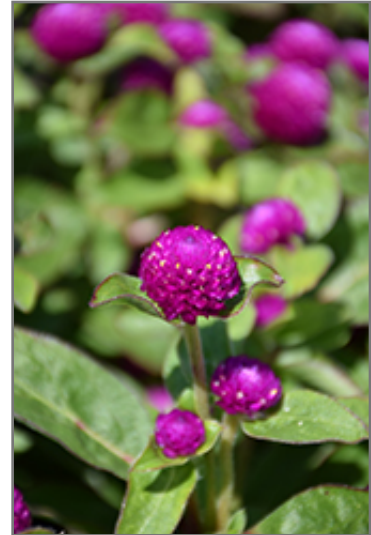
Gnome Purple Gomphrena flowers

Gnome Purple Gomphrena is recommended for the following landscape applications;