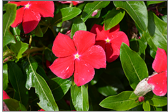
Cora XDR Red Vinca flowers

Cora XDR Red Vinca is recommended for the following landscape applications;