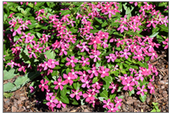
Soiree Kawaii Red Vinca in bloom