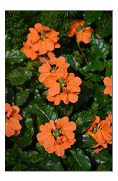
Orange Marmalade Firecracker Plant flowers

This plant does best in full sun to partial shade. It does best in average to evenly moist conditions, but will not tolerate standing water. It may require supplemental watering during periods of drought or extended heat. It is not particular as to soil pH, but grows best in rich soils. It is somewhat tolerant of urban pollution. This is a selected variety of a species not originally from North America. It can be propagated by cuttings; however, as a cultivated variety, be aware that it may be subject to certain restrictions or prohibitions on propagation.