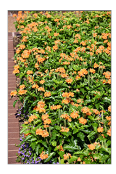
Orange Marmalade Firecracker Plant in bloom