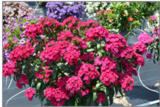
Jolt Cherry Hybrid Pinks in bloom