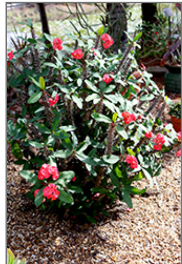
Crown Of Thorns in bloom