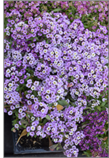
Clear Crystal Lavender Shades Sweet Alyssum flowers

Clear Crystal Lavender Shades Sweet Alyssum is recommended for the following landscape applications;