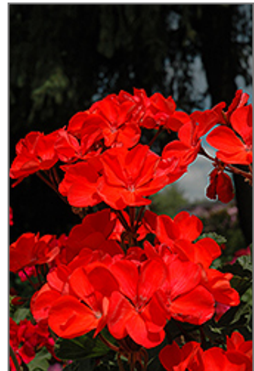
Fantasia Coral Geranium flowers