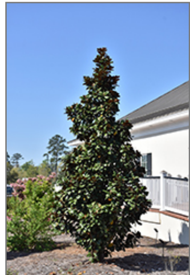
Teddy Bear Magnolia