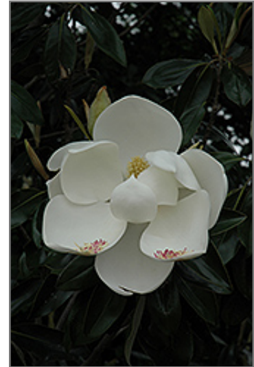
Teddy Bear Magnolia flowers