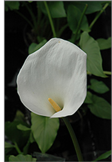
Calla Lily flowers